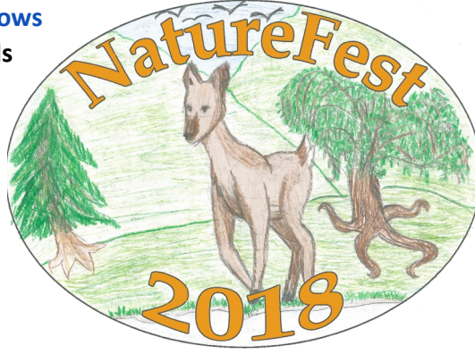
Sunday, October 7 • 10am to 3pm at Effie Yeaw Nature Center