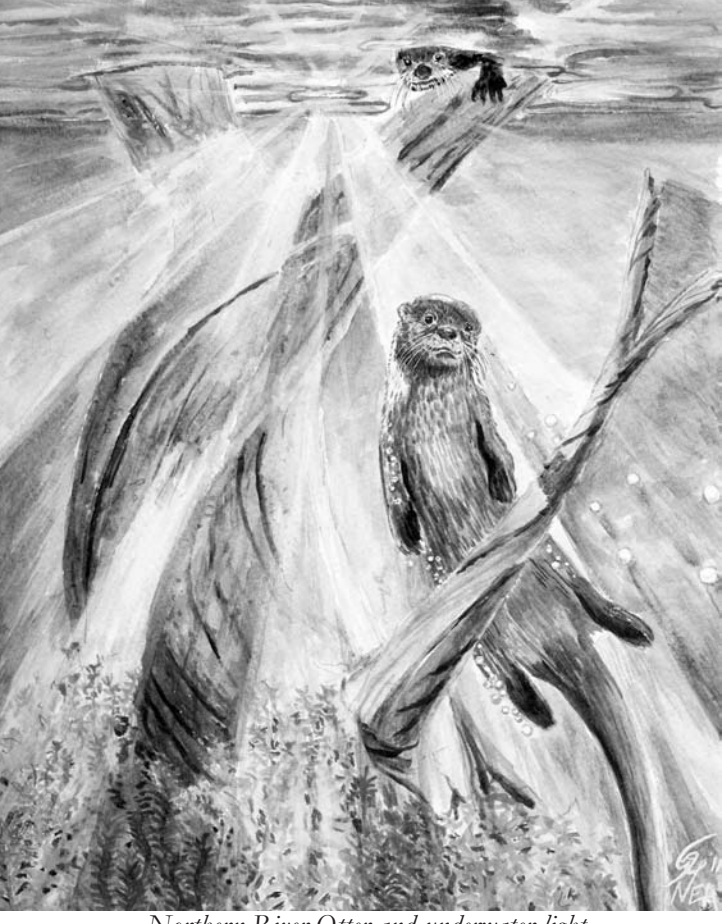
Northern River Otter and underwater light

Of course, there may be more to it than this - some deeper meaning, perhaps just beyond our grasp. This mystery, the possibility of recognizing a connection with something greater than ourselves, may serve as a calling