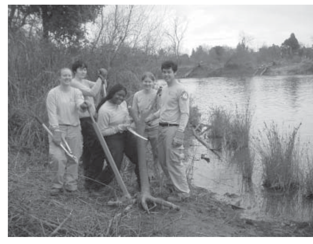
This is the largest Red Sesbania stump ever removed from the parkway! AmeriCorps volunteers removed this from the edge of the American River near Rio Americano.