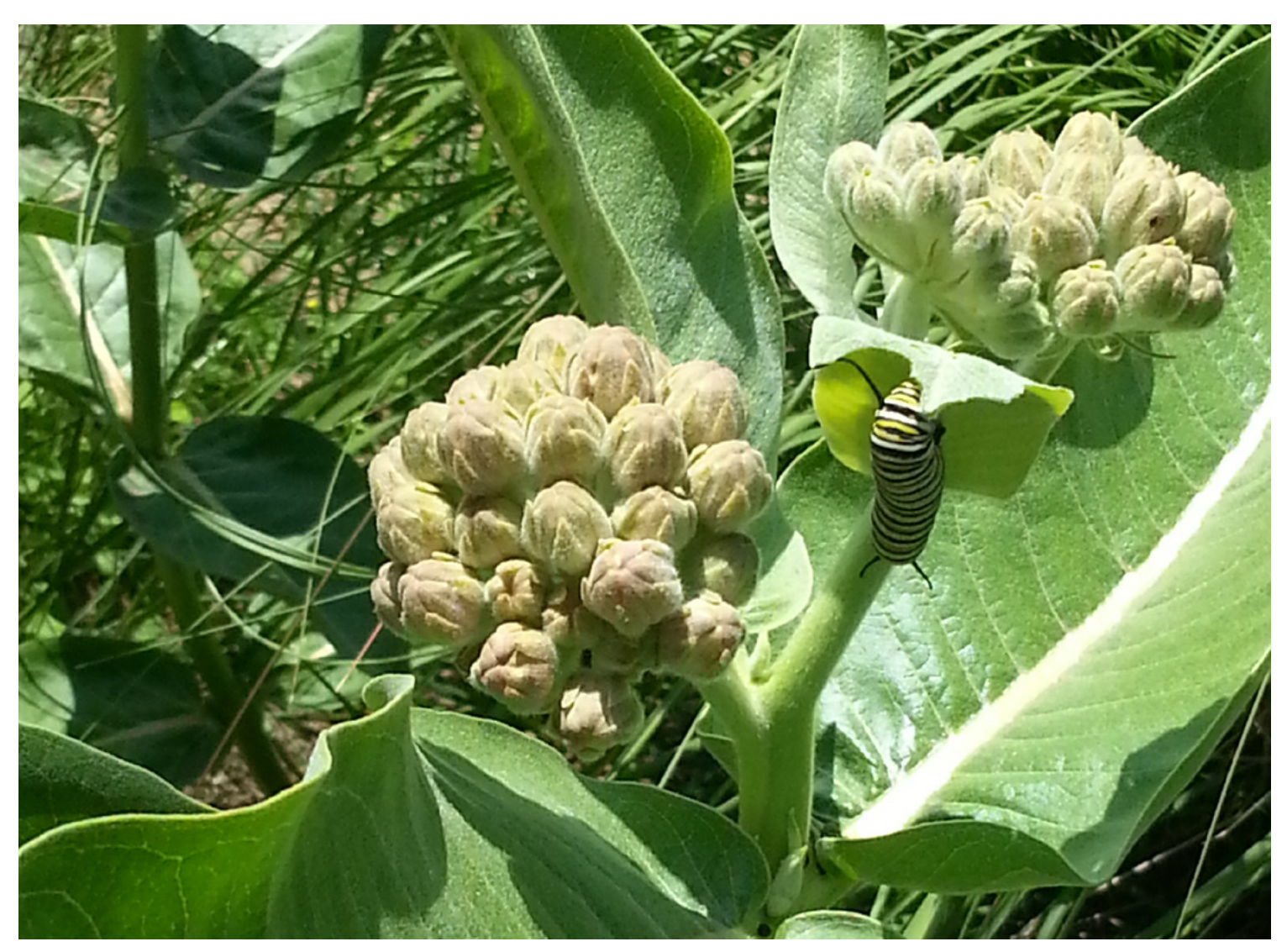
Figure 1 - Milkweed plant in flower with monarch caterpillar.

I began the project in Spring 2016 monitoring the showy milkweed plants growing around the Nature Center build-