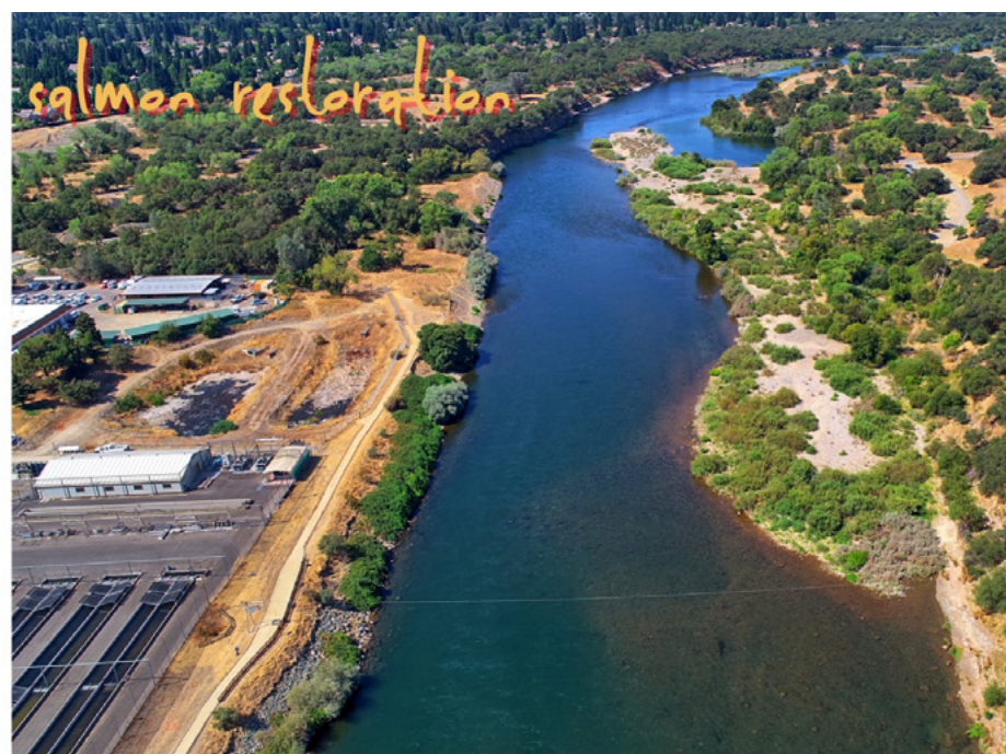
Figure 3 - Before and after restoration at Sailor Bar.

Note the gravel in the river in the "after" photo.