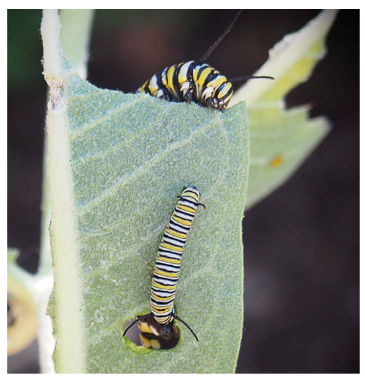
Figure 2 - Fourth and fifth instar caterpillars.

ings (Figure 1). The project involved monitoring the plants weekly to look for monarch eggs, different stages (called instars) of caterpillars, and the pupa or chrysalis stage. I also noted factors such as temperature, rainfall, and pollinator plants. During that first spring I monitored 42 plants and found one egg and eight caterpillars. I brought a few of the older caterpillars (4th and 5th instars (Figure 2)) into the Nature Center, just in time to see them pupate into their beautiful bright green chrysalises (Figure 3). These were used to educate the public about the monarch life cycle. The adult butterflies were released back into nature (Figure 4).