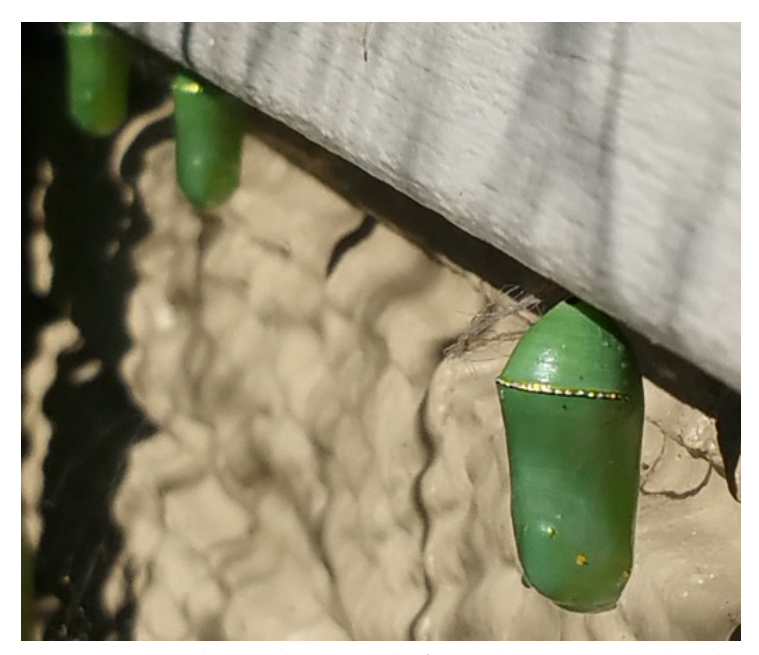
Figure 3 - Monarch chrysalises on wall of AB Building at EYNC.

Other CalNat students were encouraged to continue the project the next year. In 2017 85 plants were monitored and 8 eggs and 272 caterpillars observed. We found we needed additional recruits to monitor all the plants around the center and throughout the monarchs breeding cycle, which lasts from April through September in California. In 2018, the call went out to EYNC volunteers and local community members and over 30 volunteers jumped on board. Training sessions were held and support was provided to coordinate the team, to answer questions, and help with data entry issues. This allowed us to monitor all the milkweed surrounding the EYNC buildings, which topped out at 460 plants. We divided plants into smaller plots so that our volunteers had 70 to 110 plants to monitor. These citizen scientists monitored the milkweed plots weekly, looking under every leaf using a magnifying glass to identify eggs and other insects, noting the caterpillar instars observed, and collecting other data for submission.