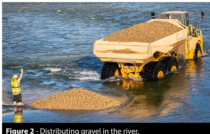
Figure 2 - Distributing gravel in the river.

along the river. These projects use existing materials to create the sites, thus avoiding bringing in any additional foreign materials. River rock left from mining days is ground into appropriately sized gravel, and any trees or brush removed to make room for the gravel beds are relocated to provide shelter and habitat along the rearing channels.