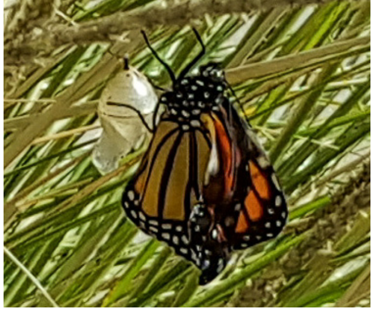
Figure 4. Newly emerged monarch butterfly on its chrysalis.

Our fourth year of the project in 2019 saw expansion of the MLMP project beyond EYNC. MLMP training was provided by EYNC to other community members interested in joining a citizen science project and monitoring milkweed in their own areas. Volunteers from Elderberry Farms, Koobs Nature Area, and two community members who wanted to monitor the milkweed in their home gardens were all trained, along with a new cohort of volunteers for the EYNC plots. All of the observations and collected data are being used by the MLMP scientists to track monarch activity across the nation.