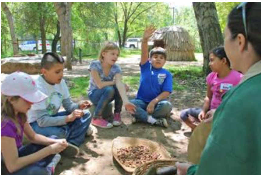
Children gain an understanding and respect for the Maidu culture