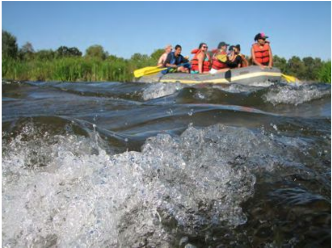
Board members, staff and volunteers get a chance to enjoy the Lower American River