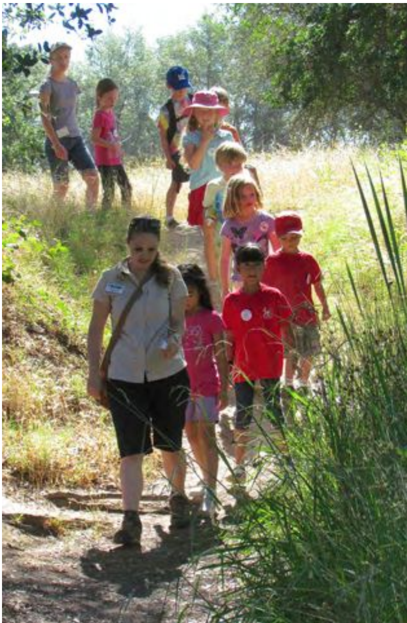
The Naturalists create, plan, and execute all of our educational programs