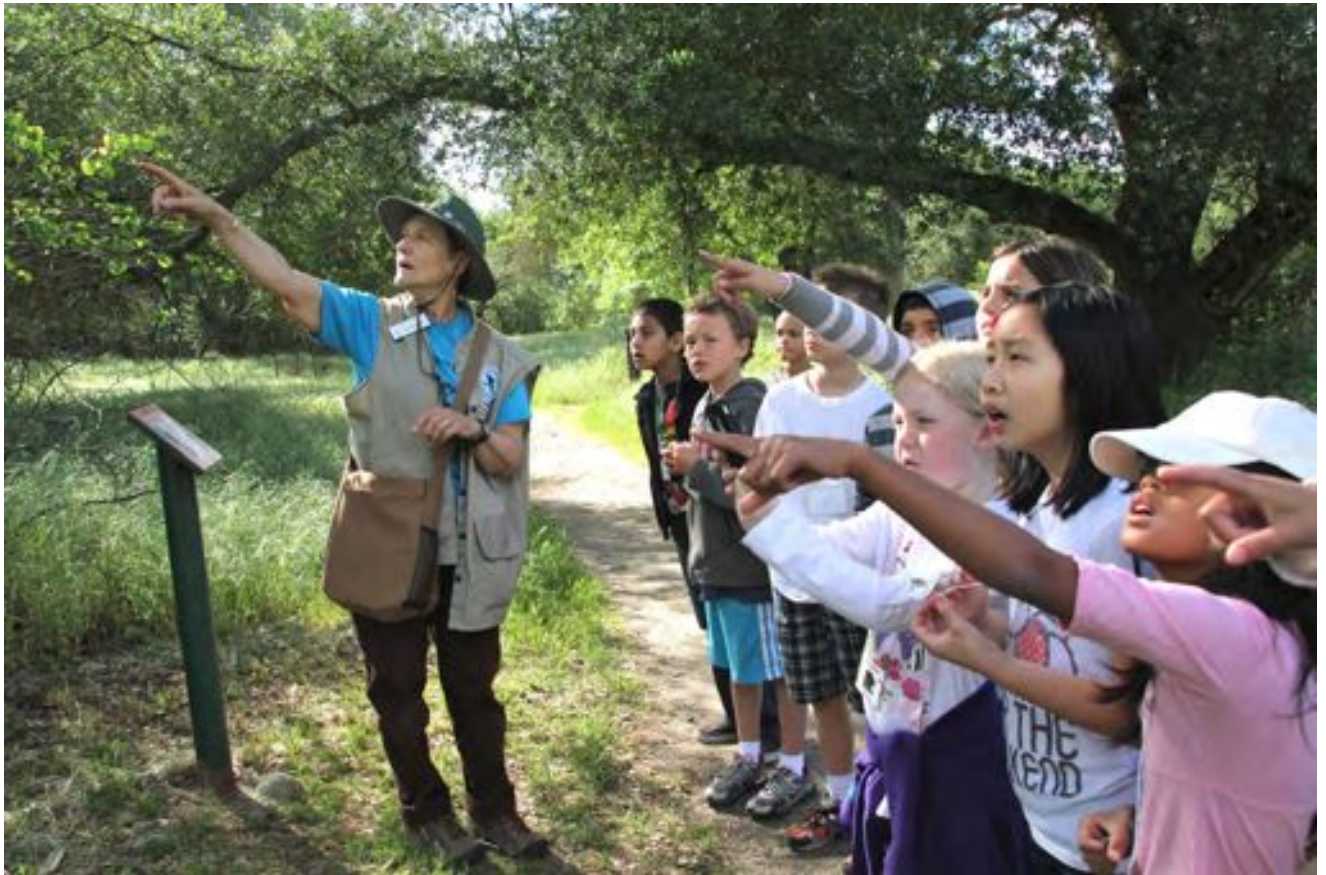
Students making discoveries during a nature hike at Effie Yeaw Nature Center