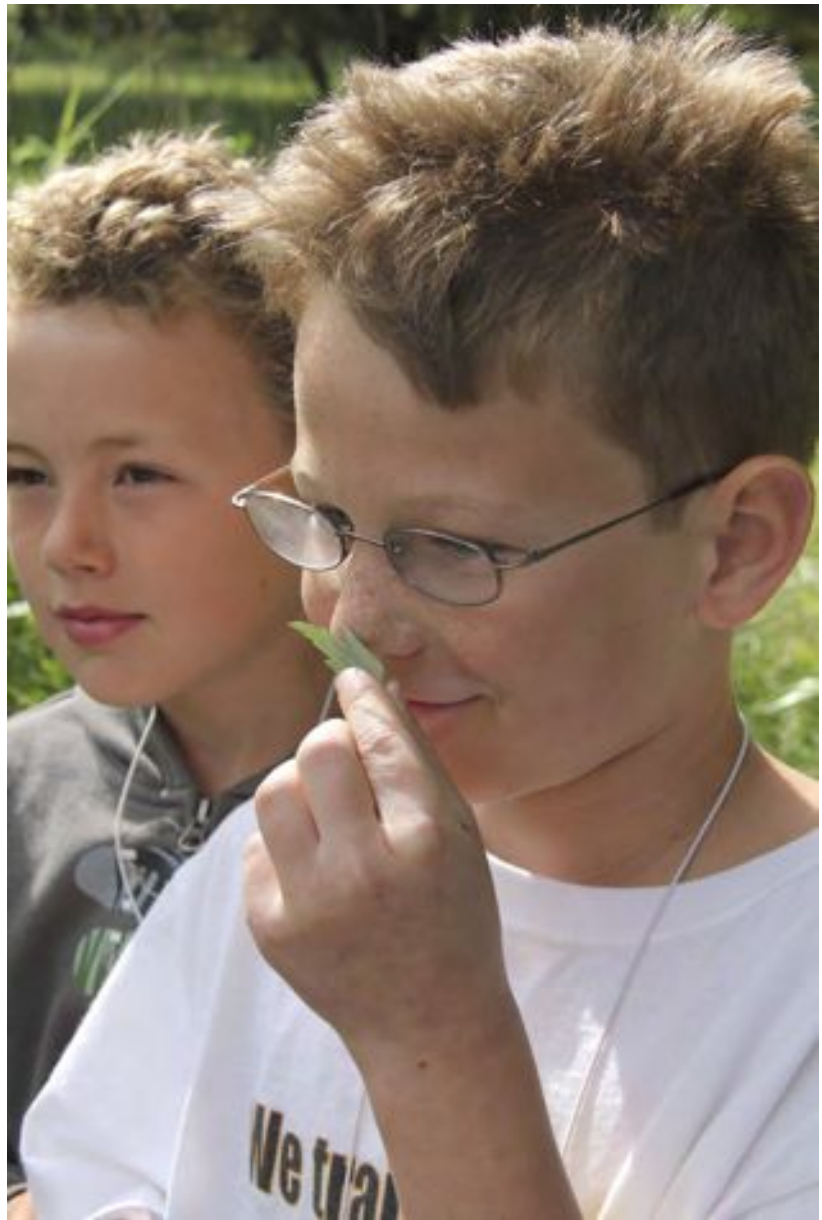
Students learning about local native plants

~ 1 st grade teacher on a classroom Outreach Presentation