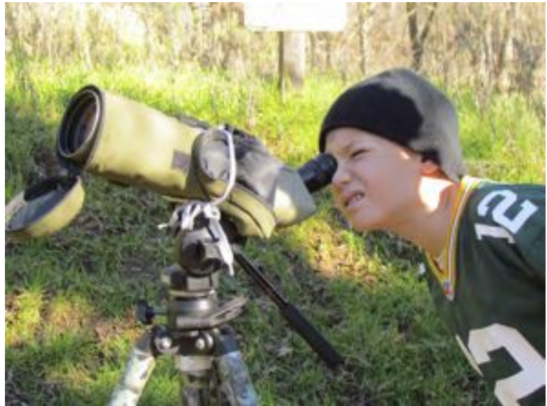
Part of the Nature Center experience is seeing one's environment in a new way

~ Kindergarten teacher on the Nature Area Tour