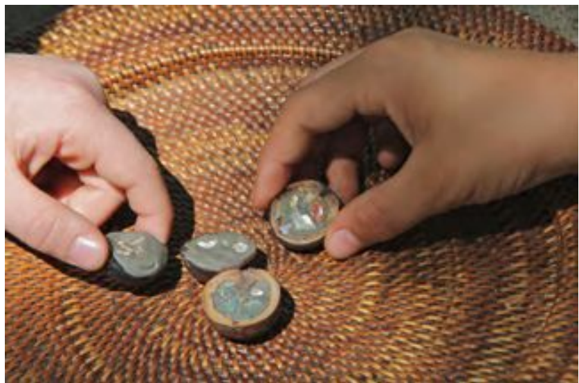
Students enjoy hands-on learning during camps and educational programs