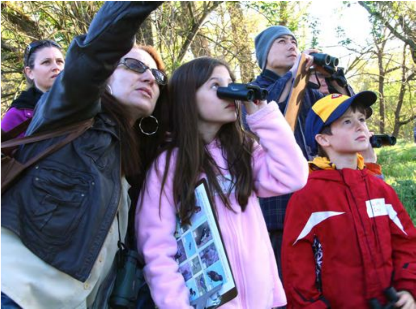
Families scanning the trees at the Bird and Breakfast event

“We are so impressed with the organization of the camp and its leaders. My son comes home every day with so much information and stories to share!”