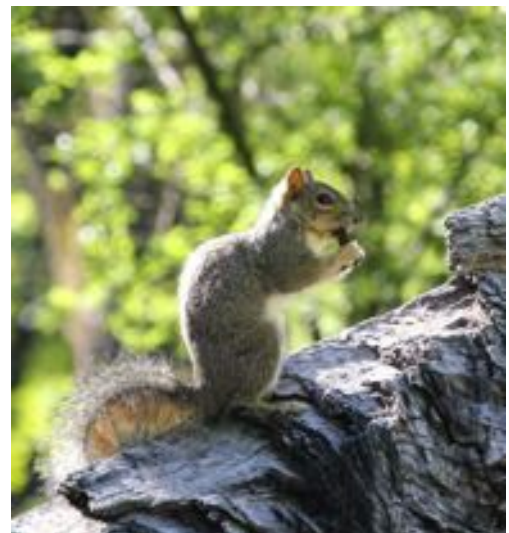
One of the many reasons our youngest visitors love the Nature Preserve