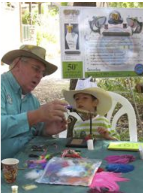
Exhibitors, such as Trout Unlimited and California Fly Fishers Unlimited, help make Nature Fest a successful annual event