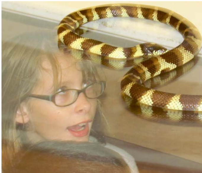
Understanding a snake from beneath clear acrylic sheet